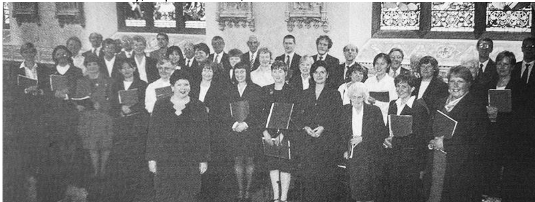
Photo from Sursum Corda, 2000: Members of the Cathedral's 150th Anniversary Mass Choir